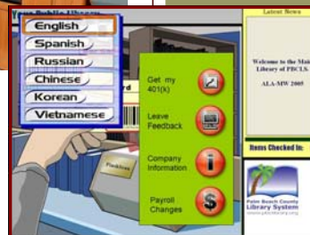
Simple, interactive, intuitive user screens

LAT's technology is used by millions of people throughout the country in public libraries and universities.